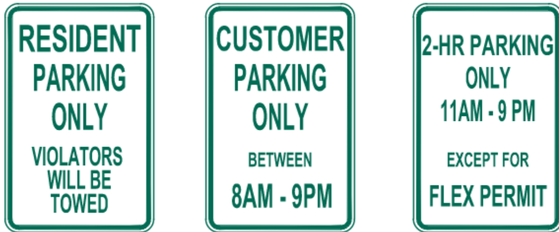
Figure 1. Example Parking Signs

Parking regulation signs will be posted on-site. Signage will be provided within the garage to delineate the stall types. Signage will be placed in front of spaces or placed on columns using directional arrows to indicate the parking restrictions. Examples of parking signs that can be used are below: